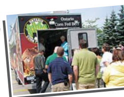
Appearance by Ontario Cattle Feeders' Association's "There's No Taste Like Home" mobile trailer

The Official Launch & Cooking "Local" Demo 11:00 am to 12:30 pm