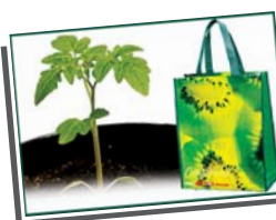
First 300 will receive a tomato plant compliments of Gesto Farms and a Green Grocery Bag compliments of Sobeys