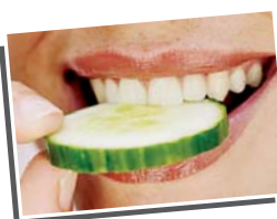
Treat your taste buds to a variety of delicious 'local' food tastings