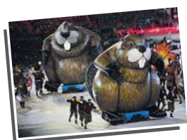
2010 Olympics Canadian Beaver and proud mascot of Tourism Windsor Essex Pelee Island