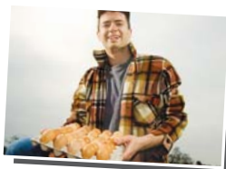
Meet Essex County Farmers and find out why it is important to buy local.