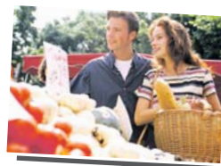
Displays: Promoting Local Products and Attractions